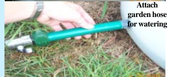
Attach garden hose for watering