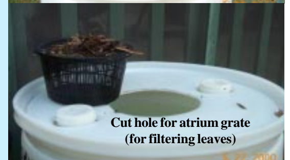
Cut hole for atriium grate (for filtering leaves)