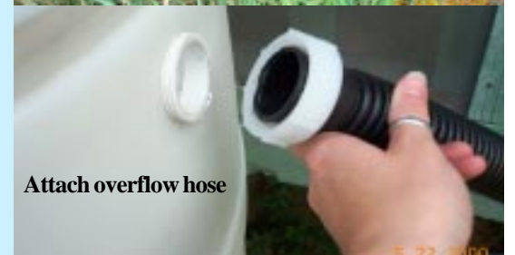
Attach overflow hose