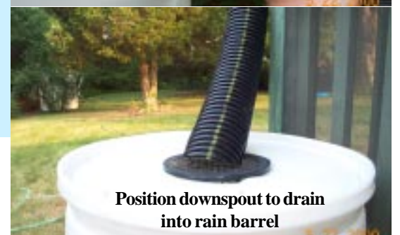
Position downspout to drain into rain barrel